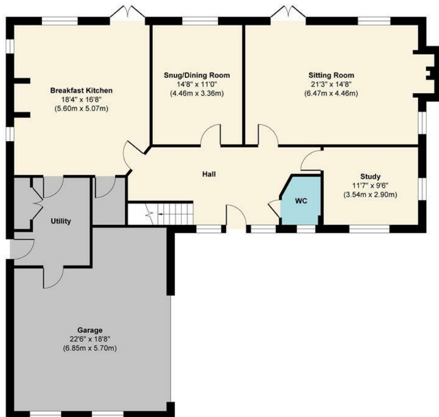
Ground Floor Approximate Floor Area 1611 sq. ft (149.71 sq. m)