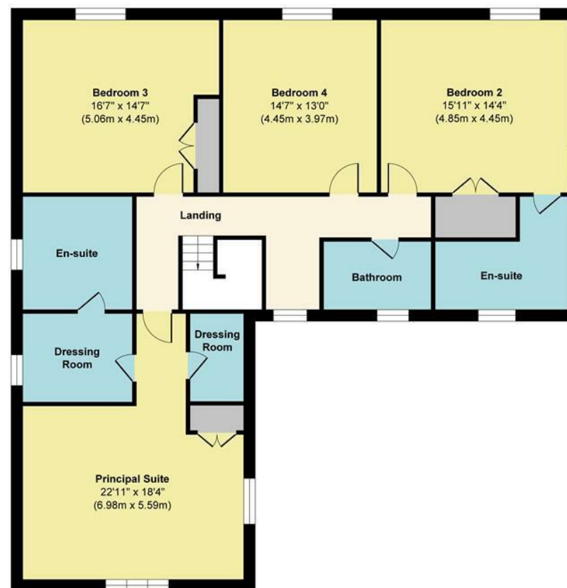
First Floor Approximate Floor Area 1520 sq. ft (141.29 sq. m)

Approx. Gross Internal Floor Area 3131 sq. ft / 291.00 sq. m (Including Garage)